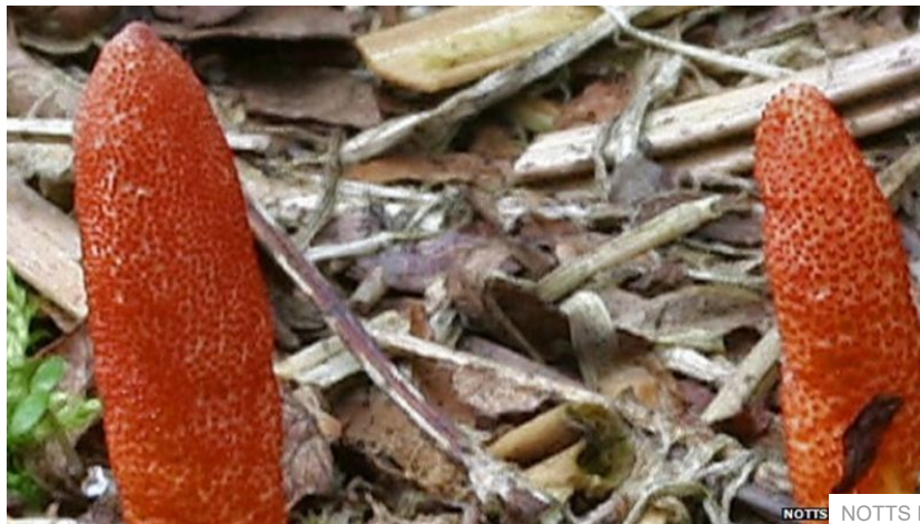
NOTTS FUNGI GROUP

The fungus is used as a traditional medicine in China and is also added to chicken soup as a tonic