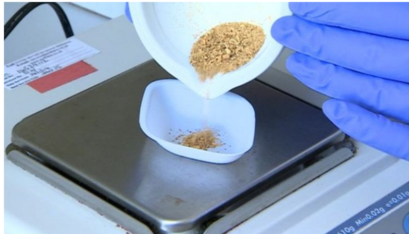
The mushroom is given to rats to see if it can alleviate pain in joints